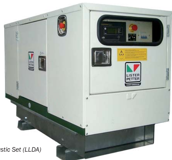
Acoustic Set (LLDA)