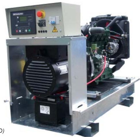
Open Set (LLD)